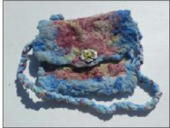
White Fireweed Farm Fiber Purse

Next Newsletter Deadline - Wednesday, April 5, 2023 Send any items to fairbanksweavers@gmail.com Thank you!