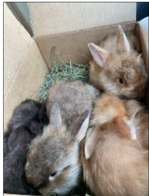
Beautiful Colors of White Fireweed Farm Angora Rabbits