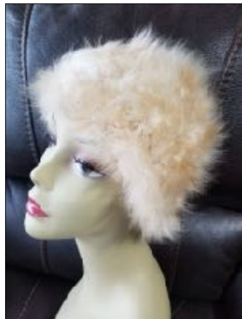
Custom Angora Hat