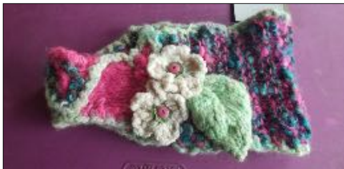
White Fireweed Farm Headband