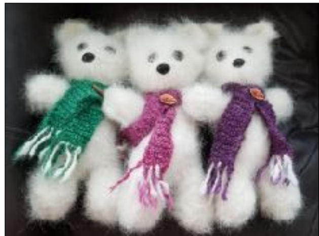
Custom Teddy Bears