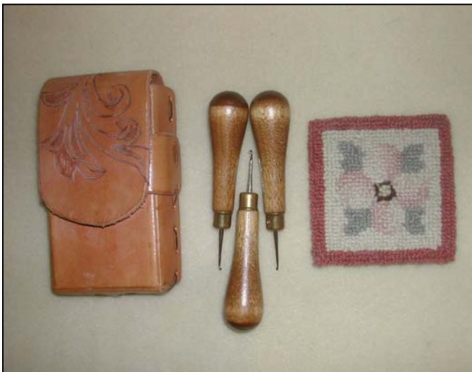
PORTABLE PROJECT – Small rug hooking tools to use up small scraps of yarn for coasters etc.

WEED AND THE GARDEN WILL GROW DYE WORKSHOP IN LATE AUGUST