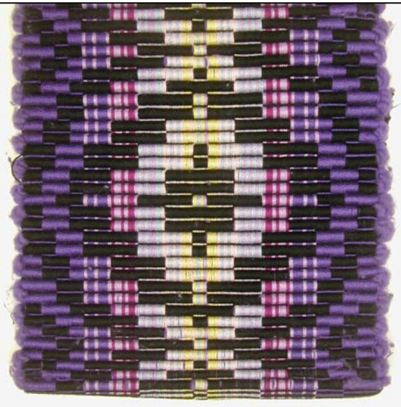
Twill Ripsmatta – 5/2 COTTON Designed by Angela Bell