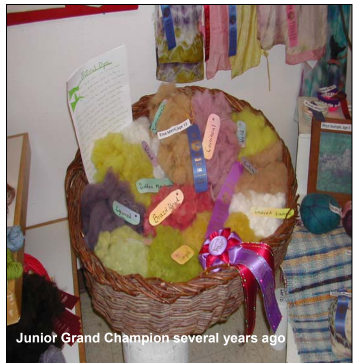
Junior Grand Champion several years ago