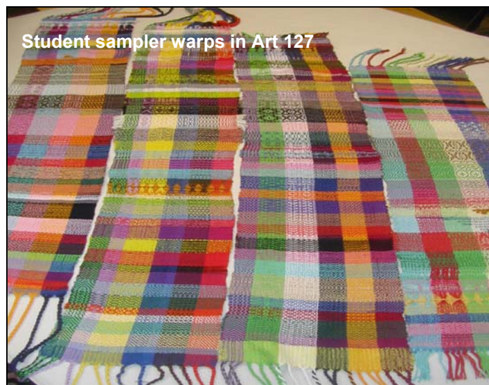
Student sampler warps in Art 127