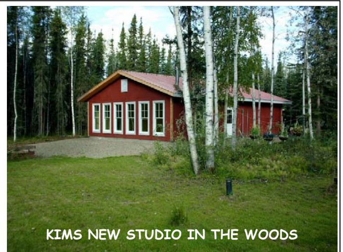
KIMS NEW STUDIO IN THE WOODS