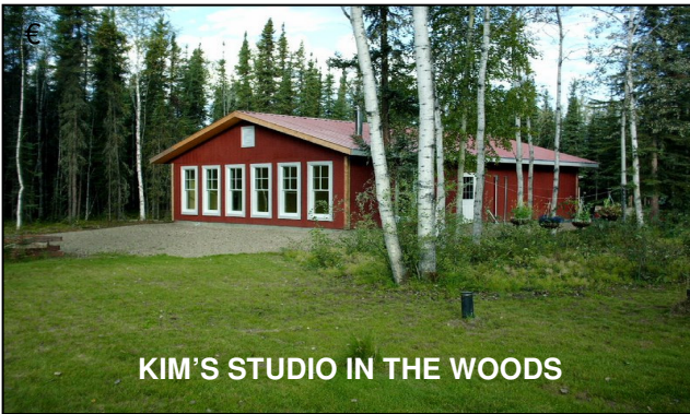
KIM'S STUDIO IN THE WOODS

TAILGATE SALE, STASH Reduction or give-away fiber.