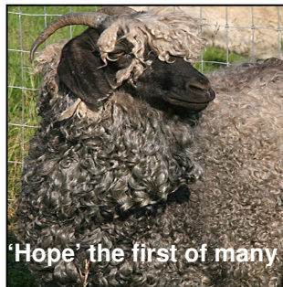
'Hope' the first of many