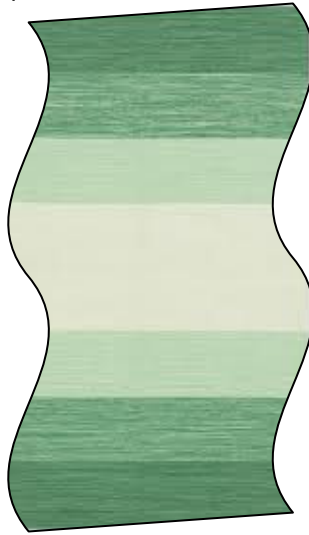
Make a Shaded Rug with Sock tops